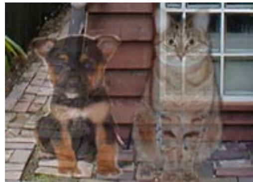
Ghost Pets? Well, they are cheap to feed!